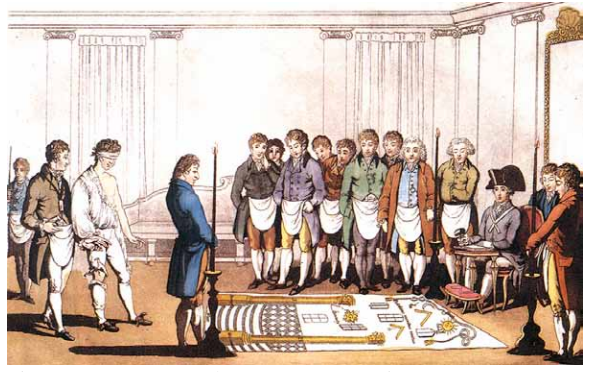
English: Initiation of an apprentice Freemason around 1805 based on the original engraving of Gabanon dated 1745. The costumes are changed to the English fashion and the engraving is coloured, but is otherwise that of 1745.

Do you seriously declare, upon your honour, that unbiased by friends and uninfluenced by mercenary motives, you freely and voluntarily offer yourself as a candidate for the mysteries of Masonry?